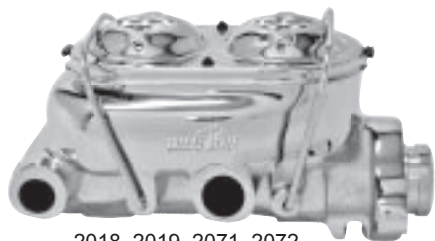
2018, 2019, 2071, 2072