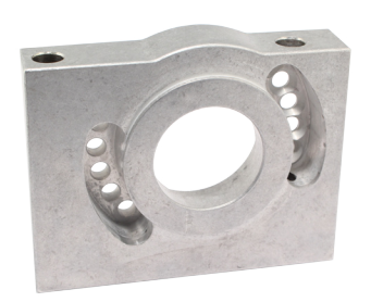
13186 Oldsmobile & Pontiac w/stock flywheel, driver side block mounting

CAUTION: NEVER OPERATE STARTER MOTOR MORE THAN 30 SECONDS AT A TIME WITHOUT ALLOWING IT TO COOL FOR AT LEASE TWO MINUTES. Overheating caused by extended cranking will damage the starter motor and void warranty.