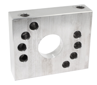
13310 GM LS1 & LS6

Gear reduction starters have 4 or 5 mounting holes so they can be mounted and indexed. Verify that the pinion gear will engage into the flywheel before final bolt torquing. If the starter interferes with the engine block or any component, the entire starter can be indexed about the nose to gain additional clearance.