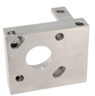
3193 Straight Block 153 or 168 Tooth Flywheel